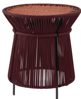
black red/copper/black 01ACAHT-N