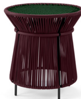
black red/moss green/black 01ACAHT-M