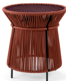
copper/black red/black 01ACAHT-O