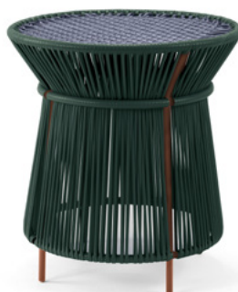
moss green/dark blue/copper 01ACAHT-R