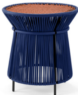
dark blue/copper/black 01ACAHT-J