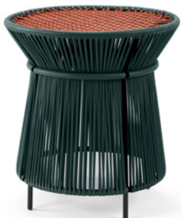
moss green/copper/black 01ACAHT-I