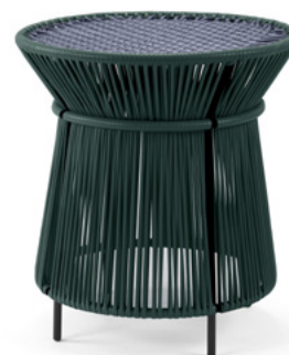
moss green/dark blue/black 01ACAHT-P