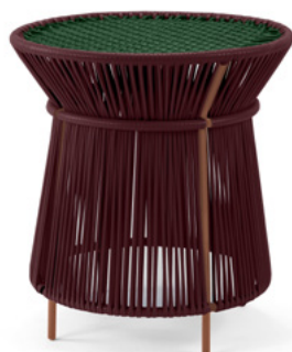
black red/moss green/copper 01ACAHT-Q