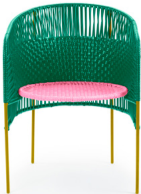
emerald green/ bubblegum rose/curry yellow 01ACADC-F