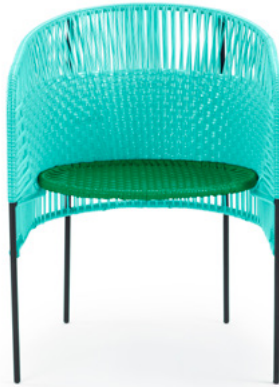
turquoise/ emerald green/black 01ACADC-C