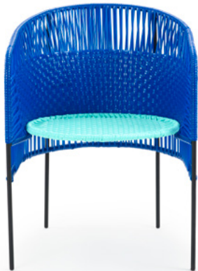
signal blue/ turquoise/black 01ACADC-B