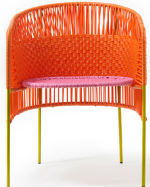
orange/ bubblegum rose/curry yellow 01ACADC-E