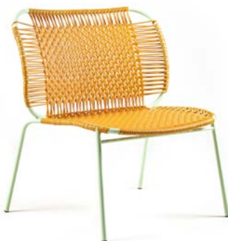
honey yellow/pastel green 00ACLC1-6