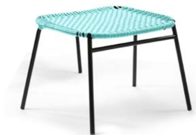
light green/black 00ACFS-2