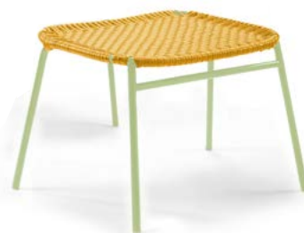
honey yellow/pastel green 00ACFS-6