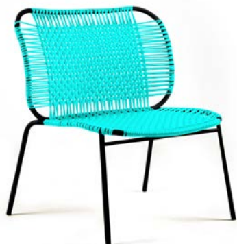
light green/black 00ACLC1-2