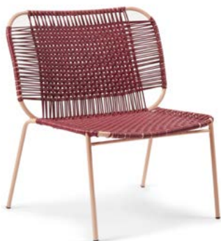
red/pink sand 00ACLC1-5