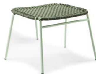
olive green/pastel green 00ACFS-4