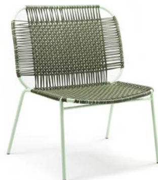
olive green/pastel green 00ACLC1-4