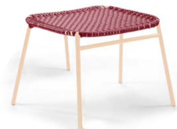
red/pink sand 00ACFS-5