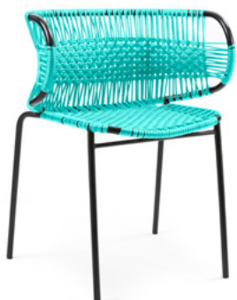
light green/black 00ACSCA-2