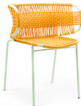
honey yellow/pastel green 00ACSCA-6