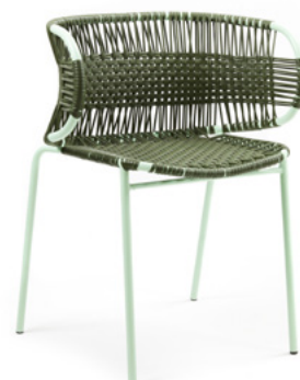
olive green/pastel green 00ACSCA-4