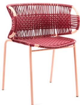
red/pink sand 00ACSCA-5